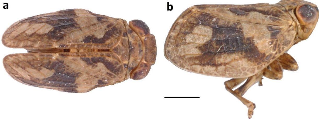
Figure 1. Latilica maculipes (Melichar, 1906) female. a = dorsal view; b = lateral view. Scale bar = 1 mm.

Habitus. Detailed description of the habitus of L. maculipes was provided by Melichar (1906) and furthermore, Gnezdilov & Mazzoni (2004) published the description of the genitalia of both sexes. Length of body 4.8–5.2 mm. The general appearance of the adult is shown in Figs. 1a–b.