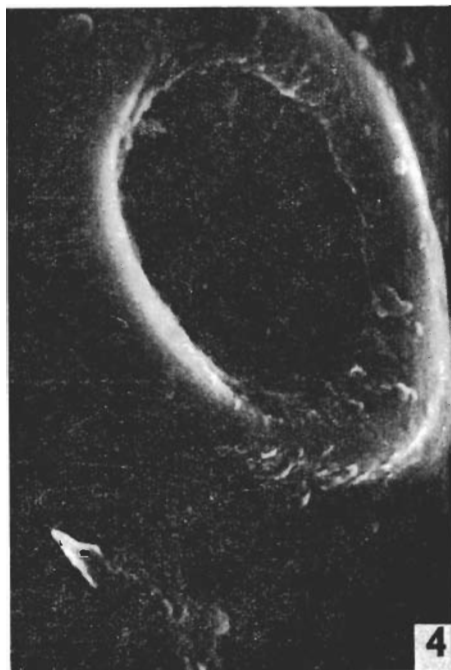
Photographs 1--4. 1: 4th abdominal segment of Caenis horaria , dorsal side (2450 x); 2: 2nd leg of Cloeon dipterum , last segment, ciliary hairs (1480 x); 3: crater-like sense organs under the gills of Caenis robusta (2450 x); 4: crater-like sense organ under the gill of Caenis robusta (8200 x).