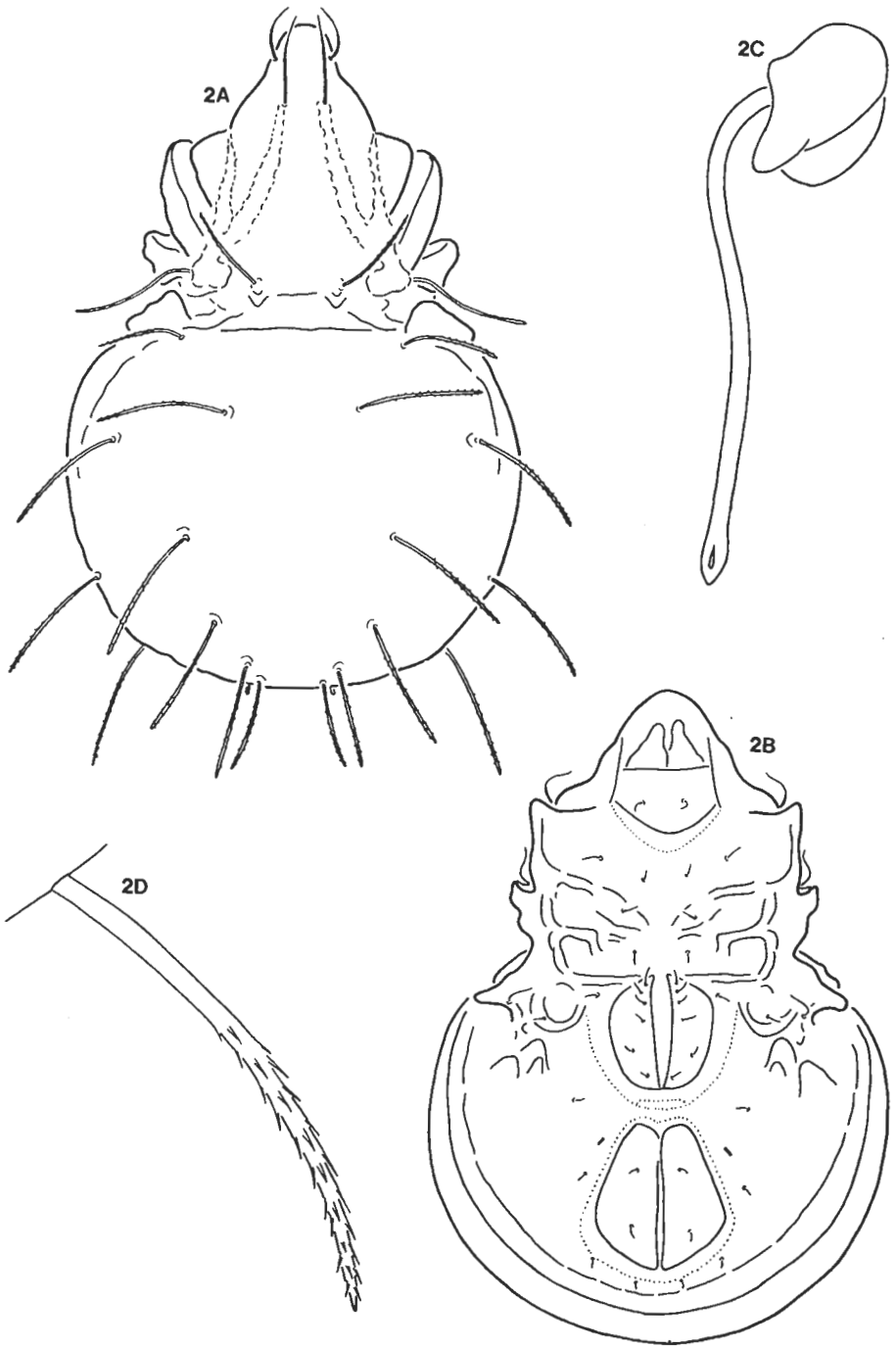
Fig. 2. Anderemaeus sturmi sp. n. A: dorsal side; B: ventral side; C: sensillus; D: notogastral seta