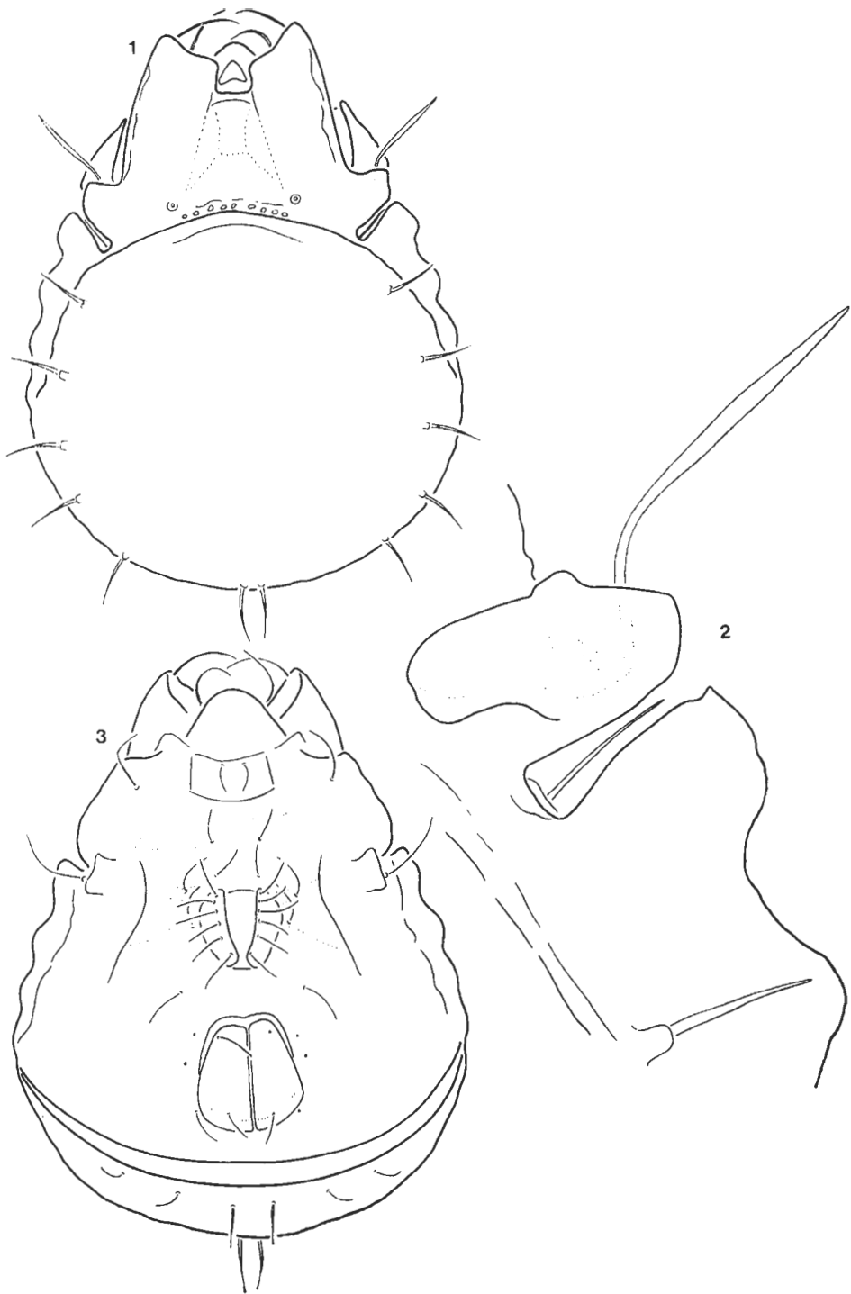
Figs. 1–3. Hamotegaeus longiseta sp. n. 1: Dorsal view; 2: Bothridium, sensillus and humeral appendage; 3: Ventral view