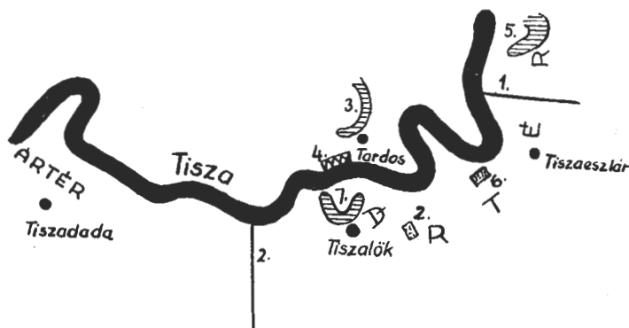
Fig. 2. The Tisza between Tiszadada and Tiszaeszlár, 1: Bazsi canal, 2: Eastern main canal, 3: Tardos backwater, 4: Tardos loess bank, 5: Tiszaeszlár backwater, 6: Tiszaeszlár willow grove, 7: Tiszalök backwater, 8: Tiszalök willow grove

Extensive meadows are typical of this region. They took the place of dried out swamps and rush patches after the river had been artificially controlled. In lower lying areas the water collects in spring and dries out during the middle of May. The monotony of the flat meadows is broken by willow bushes. The appearance of these bushes, noticeably enriches the bird fauna through providing new nesting places.