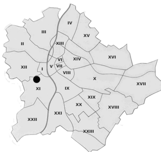
Figure 1. Location of the Sas-hegy Nature Conservation Area in District XI, Budapest

Both qualitative and quantitative samples were collected; the latter were taken by using a convertible iron cylinder of 5,05 cm diameter ( A = 20 \text{ cm}^2 ). The samples were taken from 0 to 8 cm depth, and later divided into an upper (0–3 cm) and a lower (3–8 cm) section. Animals were extracted with the O'Connor wet funnel method (O'Connor, 1962). For microscopic investigations, the living worms were put on glass slides in a few drops of water and covered with cover slips. The pressure of the cover slip is necessary to immobilize the worms and to flatten the body, in order to make the internal organs visible. The large or too agile animals were narcotized with sparkling mineral water.