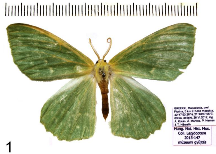
Figure 1. Image of Geometra papilionaria L. from Greece.