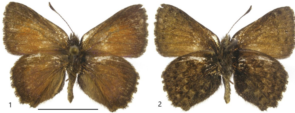
Figures 1–2. Penaincisalia alina sp. nov. Holotype. 1 = recto; 2 = idem, verso. The violet sheen of the dorsal wingsurfaces was not caught by the camera because of the light conditions (for colour reflection see Figs. 8–9) (scale: 10 mm).