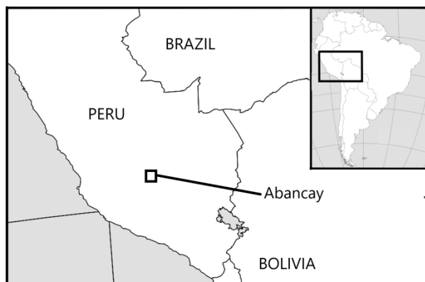
Figure 5. “Abancay”, in department Apurímac, the type locality of Penaincisalia alina sp. n. as situated geographically in Peru.