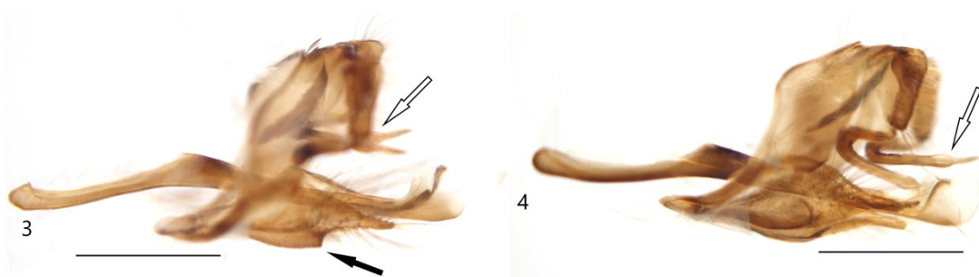
Figures 3–4. Male Penaincisalia genitalia capsule and aedeagus in dorsal view, in same magnification. 3 = P. alina sp. nov. (holotype; Bálint gen. prep. no. 1659) (a black arrow indicates the genitalia character of P. alina ; white arrows point to gnathos before the pointed terminus, what showing a character state to be the supposed apomorphy of Penaincisalia s. str.) 4 = P. aurulenta K. Johnson, 1990 (Peru, Llanganuco; Bálint gen. prep. no. 1660) (scale bars = 0.8 mm).