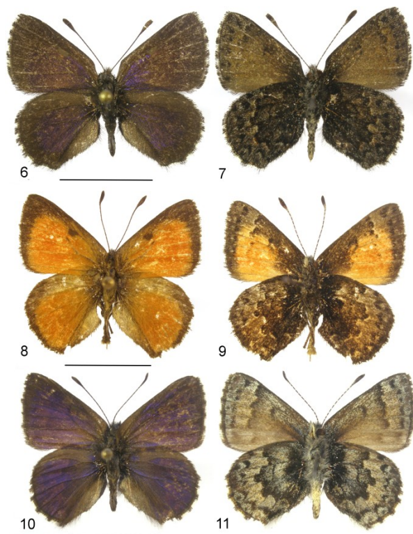
Figures 6–11. Males of various Penaincisalia species from Peru for comparison. Scales: 10 mm. 6–7 = P. alatus (Druce, 1907) (dorsal wingsurfaces deep violet with wide black margin): 6 = recto, 7 = verso (Peru, Cordillera Blanca, above Huanuco); 8–9 = P. aurulenta K. Johnson, 1990 (dorsal wingsurfaces orange with goldish shade): 8 = recto, 9 = verso (Peru, Cordillera Blanca, Llanganuco); 10–11 = P. biophot Bálint & Wojtusiak, 2008 (dorsal wingsurfaces light deep violet): 10 = recto, 11 = verso (paratype, Peru, Cordillera Blanca, Llanganuco).