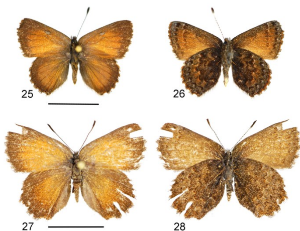
Figures 25–28. Documentation of an undescribed orange Penaincisalia species from Apurímac, Peru. 25 = male, recto, 26 = idem verso, 27 = female, recto, 28 = idem, verso (scale: 10 mm).

The Penaincisalia specimens, collected in or in the vicinity of P. alina type locality and deposited in MUSM, most probably represent a hitherto unnamed species. This species is close to P. aurulenta , but the representative specimens have no goldish hue on the dorsal wing surfaces, they are plain orange and the wing undersides somewhat differently coloured and patterned. The species cannot be described as at the moment we