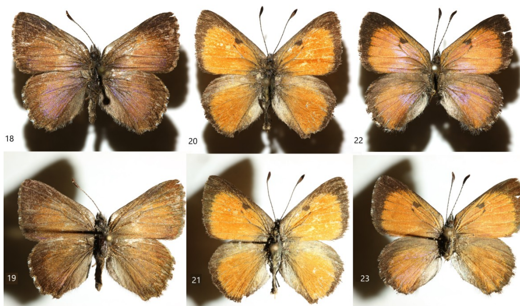
Figures 18–23. Male specimens of the known orange Penaincisalia species photographed under normal (90°) and 45° light incidence. 18–19 = P. alina sp. n., 20–21 = P. aurulenta , 22–23 = P. perezii . The direction of illumination is indicated by the black shadow situated under the specimens: 90° = there is shadow under the specimen, 45° = there is shadow only on the left side. Under 45° light incident the structural colour is not visible.

brown. Therefore the spectrum of P. alina is more similar to the spectra of blue Penaincisalia species investigated previously (Bálint et al. 2008b).