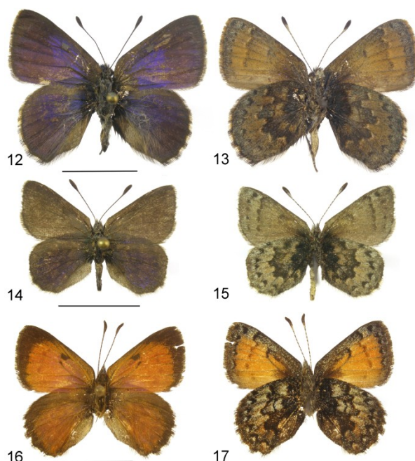
Figures 12–17. Males of various Penaincisalia species from Peru for comparison. Scales: 10 mm. 12–13 = P. culminicola (Staudinger, 1894) (dorsal wingsurfaces light violet with thin black margin): 12 = recto, 13 = verso (Peru, Apurímac, Saywite); 14–15 = P. lamasi Bálint, 2001 (dorsal forewing-surface black, hindwing forewingsurface light blue): 14 = recto, 15 = verso (Peru, Cordillera Blanca, Tingo Pampa); 16–17 = P. perezi Bálint, 2001 (dorsal wingsurface orange with pink shade): 16 = recto, 17 = verso (Peru, Cordillera Blanca, Llanganuco).

pigments and nanoarchitectures are lost or regained multiple times ( cf. Bálint et al. 2005, 2008a, b).