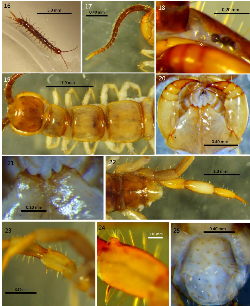
Figures 16–25. Lithobius (Monotarsobius) qingquanensis sp. nov. 16 = habitus, male; 17 = antennae; 18 = three ocelli and Tömösváry's organ (To) on the left side; 19 = anterior body, dorsal view; 20 = ventral view of the head; 21 = 2+2 coxosternal teeth and porodonts; 22 = posterior body and 15 th leg, dorsal view; 23–24 = 15 th femur, lateral view; 25 = male first genital sternite and gonopods (16–25: NMNS8103-006).

less so on basal articles, gradual increase in density to around fifth article, then more or less