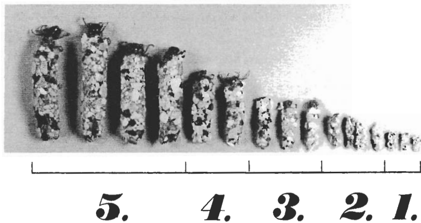
Fig. 2. Potamophylax nigricornis , larval stages