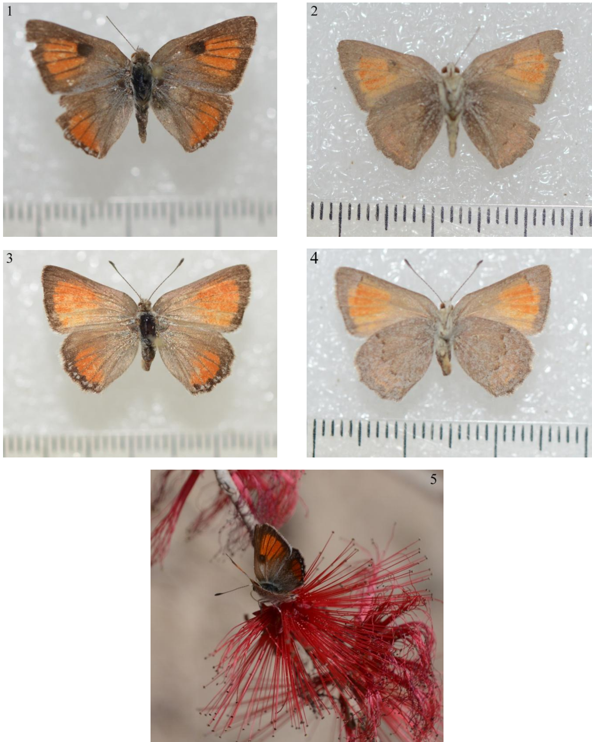
Figures 1-5. Strymon heodes (Druce, 1909) from Peru, Ancash, Caraz, 2400 m, 2002, leg. Weigend, MUSM: 1 = male dorsal, 2 = male ventral, 3 = female dorsal, 4 = female ventral; (scale: 1 mm). The gleaming scales are well visible in the basal area of the wings in both sexes. 5 = Fresh male of Strymon heodes (Druce) in nature perching on a red flower of Calliandra sp. (Mimosoideae, Fabaceae) in Peru, Department Ancash, Huaylas, at 2820m taken on 9.XII.2016.