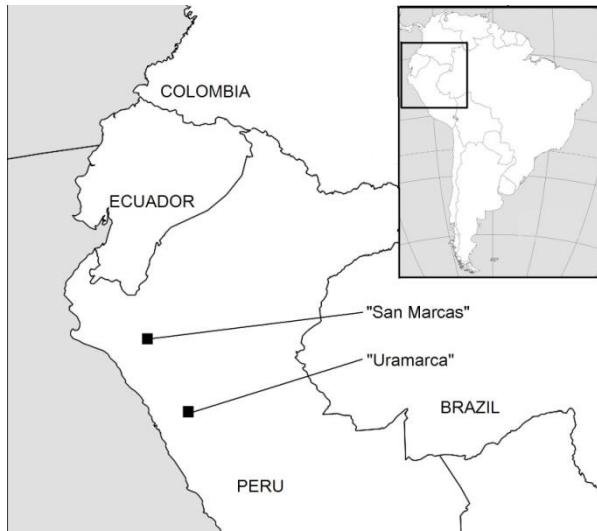
Figure 10. Localities of Thecla heodes Druce, 1909 sytype material; “Uramarca” = Yuracmarca, “San Marcos” = San Marcos (by Gergely Katona, HNHM).