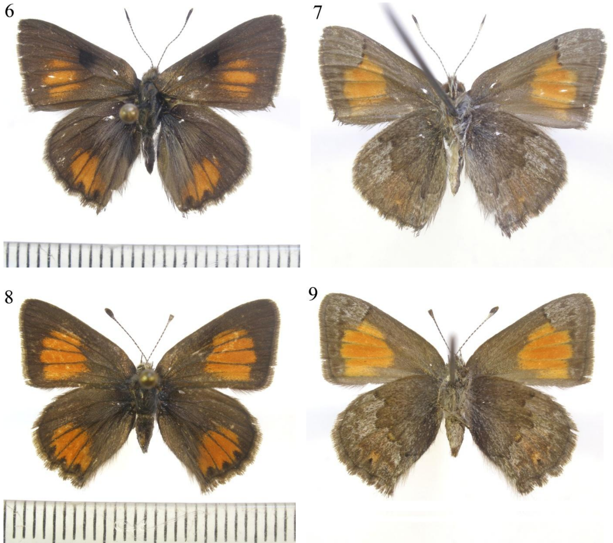
Figures 6-9. Strymon bicolor (Philippi, 1859) from Chile (Santiago, Villa Paulina, 2000 m, 1999, ex larva, leg. et coll. Dubi Benyamini, Bet Arye, Israel): 6 = male dorsal, 7 = male ventral, 8 = female dorsal, 9 = female ventral; (scale: 1 mm).

biological entities, therefore they deserve to be taxonomically recognized as species ( cf. Peña & Ugarte 1997: 210–215).