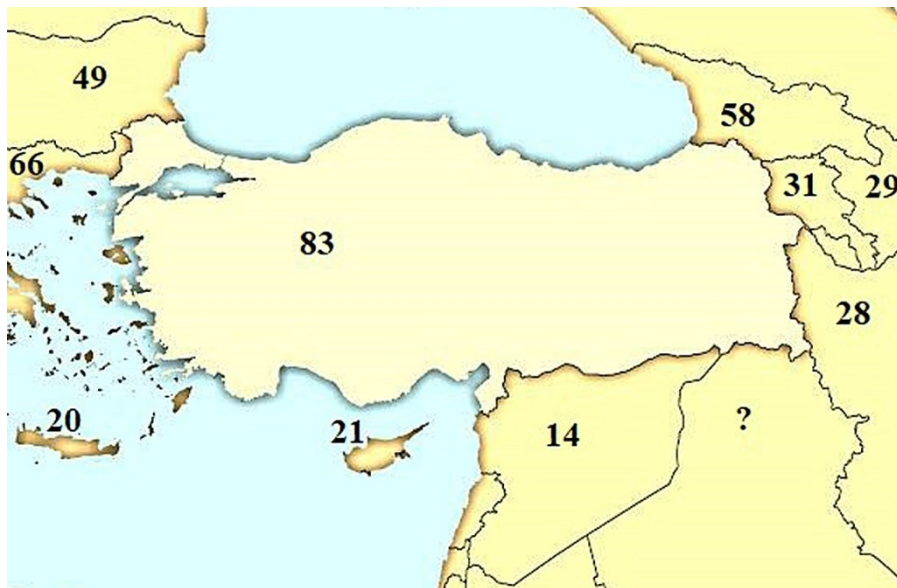
Figure 1. The number of earthworm taxa in Turkey and adjacent countries reported in the literature.

Since then Csuzdi et al. (2006) combined all Turkish faunistic results in an annotated checklist. It was the most important step to understanding the whole earthworm fauna of Turkey and followed by considerable faunistic research containing new taxa and new records ( e.g. Csuzdi et al. 2007, Szederjesi et al. 2014a, Szederjesi & Mısırlıoğlu 2017, Mısırlıoğlu 2018)